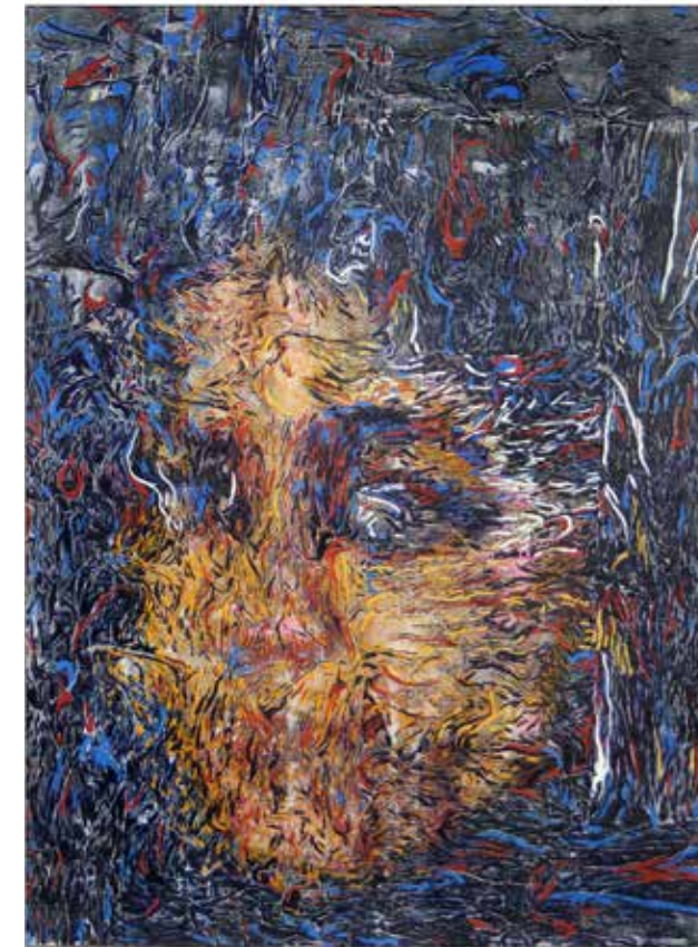
Self Portrait, Mixed Media on Paper, 20" x 22".

To be part of AI Curates write to : aicurates@artsillustrated.in