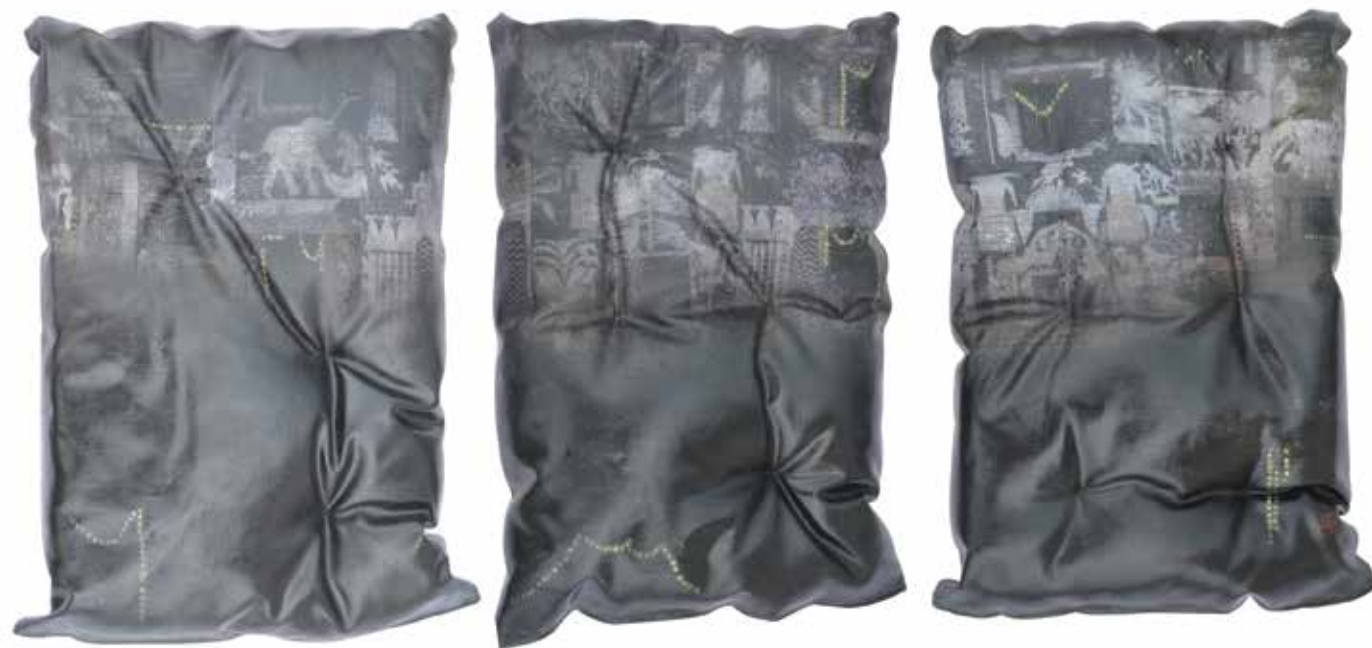
Journey 3, Mixed Media, 16" x 12" each.