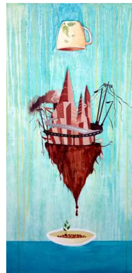
Öscillare the Blue City of Dreams, Acrylic on Canvas, 36" x 18".