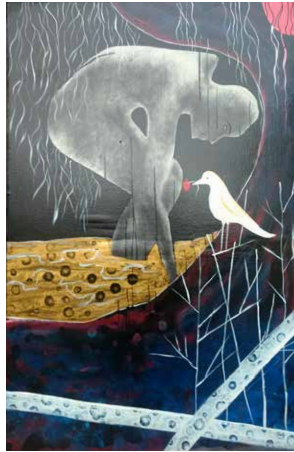
The Search, Graphite, Acrylic and Ink, 24" x 30".