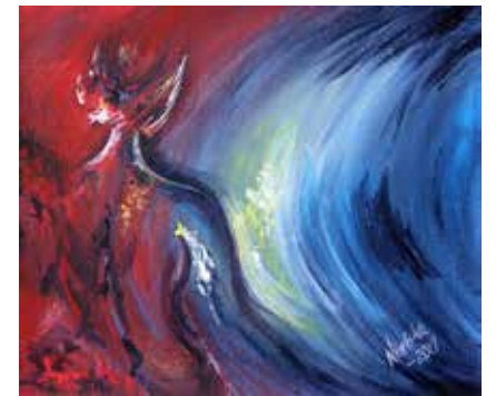
Maya, Acrylic on Canvas, 10" x 12".